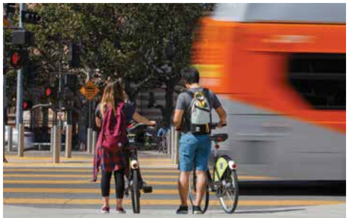
TOCs support many ways of traveling without a car.