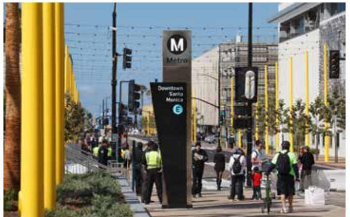
Partnerships with cities help create vibrant, walkable places.

As Metro embarks on this journey, it is important to note that there are multiple strategies for implementing TOCs. Metro will adapt its approach over time in collaboration with each community to respond to the continuously evolving landscape.